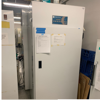
PRODUCT CODE: FF01 #6

Condition: working Location: Freezer Farm RM 01 Previously owned by: Pilon/Bush Labs