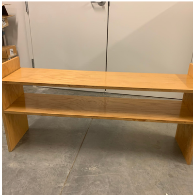
PRODUCT CODE: FF01 DSS#1

36" x 12" x 86.5" Location: Freezer Farm RM 01 Condition: Well-used | Sample bookcase pictured