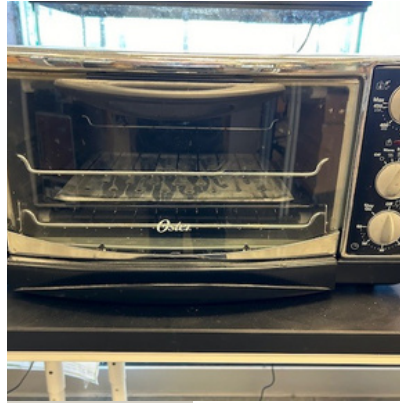
PRODUCT CODE: 261TO

Various quantities available Location: Basement | E Hallway Previously owned by: Reddy Lab Condition: New