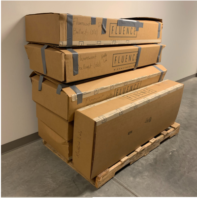
PRODUCT CODE: BHFL