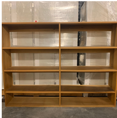
PRODUCT CODE: FF01 B#2

42" x 10" x 37" Location: Freezer Farm RM 01 Condition: Well-used