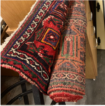
PRODUCT CODE: FF01 R#1