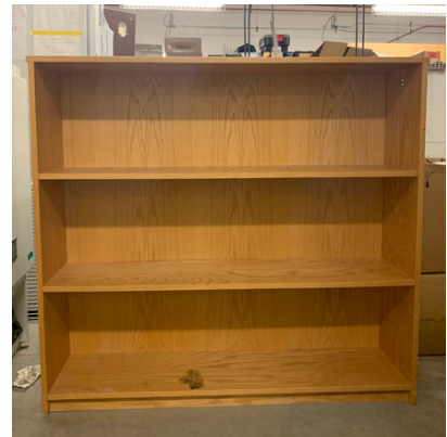
PRODUCT CODE: FF01 B#3

65" x 11" x 49" Location: Freezer Farm RM 01 Condition: OK, unstable - best for lightweight items