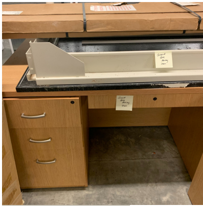
PRODUCT CODE: FF01 MD#1

Location: Freezer Farm RM 01 Condition: Great, like new