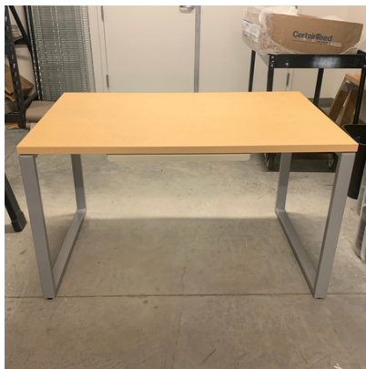
PRODUCT CODE: FF01 SD#1

Location: Freezer Farm RM 01 Condition: Well-used