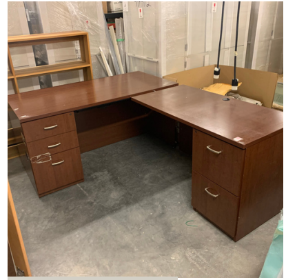
PRODUCT CODE: FF01 LD#1

Location: Freezer Farm RM 01 Condition: OK