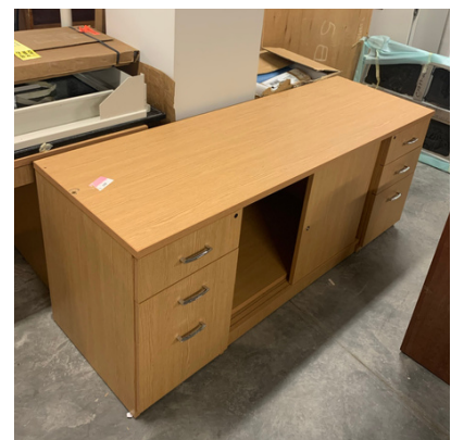
PRODUCT CODE: FF01 SC#1

Location: Freezer Farm RM 01 Includes: 3 drawers & central storage drawer Condition: Great, like new | Sample image pictured