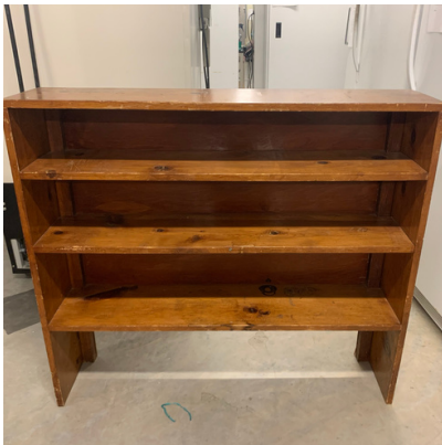
PRODUCT CODE: FF01 B#1