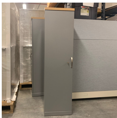
PRODUCT CODE: FF01 TSC#1

Location: Freezer Farm RM 01 Includes: Adjustable shelves for central storage Condition: Good