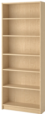
PRODUCT CODE: FF01 B#4

48" x 12" x 44" Location: Freezer Farm RM 01 Condition: Great