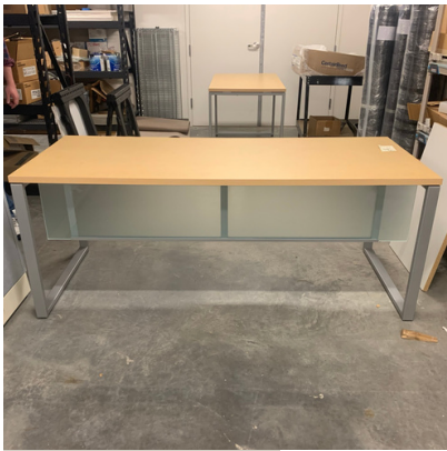
PRODUCT CODE: FF01 LD#2