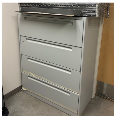
PRODUCT CODE: SC#2

Location: Freezer Farm RM 01 Includes: Key and storage organizers Condition: Great, like new