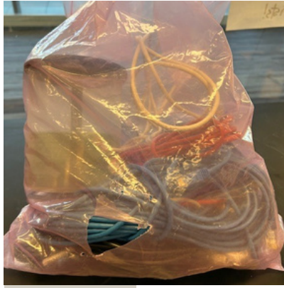
PRODUCT CODE: 261CD