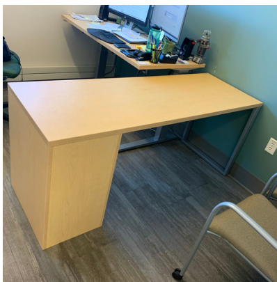
PRODUCT CODE: FF01 SD#2

Location: Freezer Farm RM 01 Condition: Great, like new